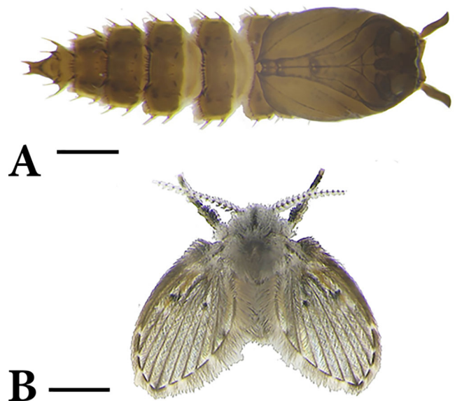
Fig. 2 Pupa and adult Clogmia albipunctata recovered from cesspool around the house of the patient. A. Dorsal view of Clogmia albipunctata pupa. B. Adult Clogmia albipunctata (Scale bar 1 mm / Pupa et adulte de Clogmia albipunctata retrouvés dans la fosse septique, près de la maison de la patiente. A. Vue dorsale de la pupa de Clogmia albipunctata . B. Clogmia albipunctata adulte (échelle 1 mm)

Several dipterans species have been implicated to cause urinary myiasis including Psychoda albipennis [11,17], Lucilia